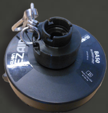
PAPR + canister