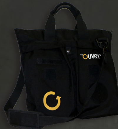
Equipment carrying bag, Pilot model (green khaki or black) Ref: 790003AA-U or