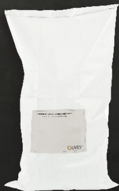
Containment bag (3 sizes) Ref: 592001AA, 592002AA or 592003AA