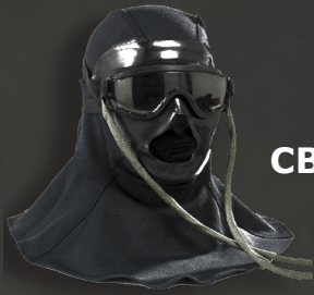
CBRN Fire resistant hood